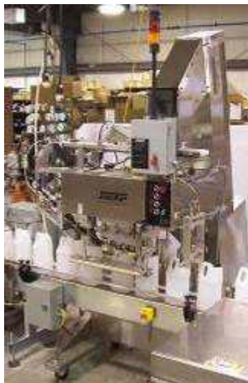
SureKap Capper Model SK6000-BF6